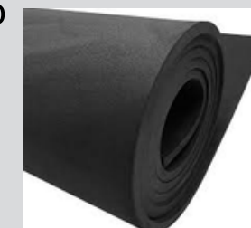
EVA Foam 20%